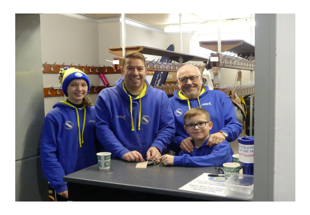
A warm welcome at the race venue.