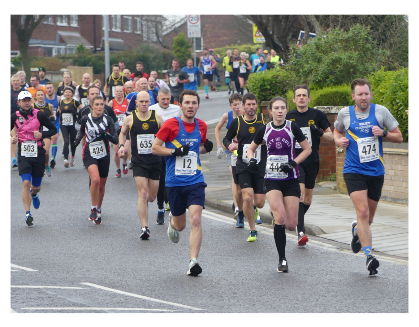
2020 Chichester Road, first time round.